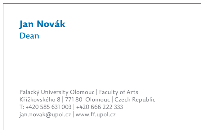
Example 2 – English version